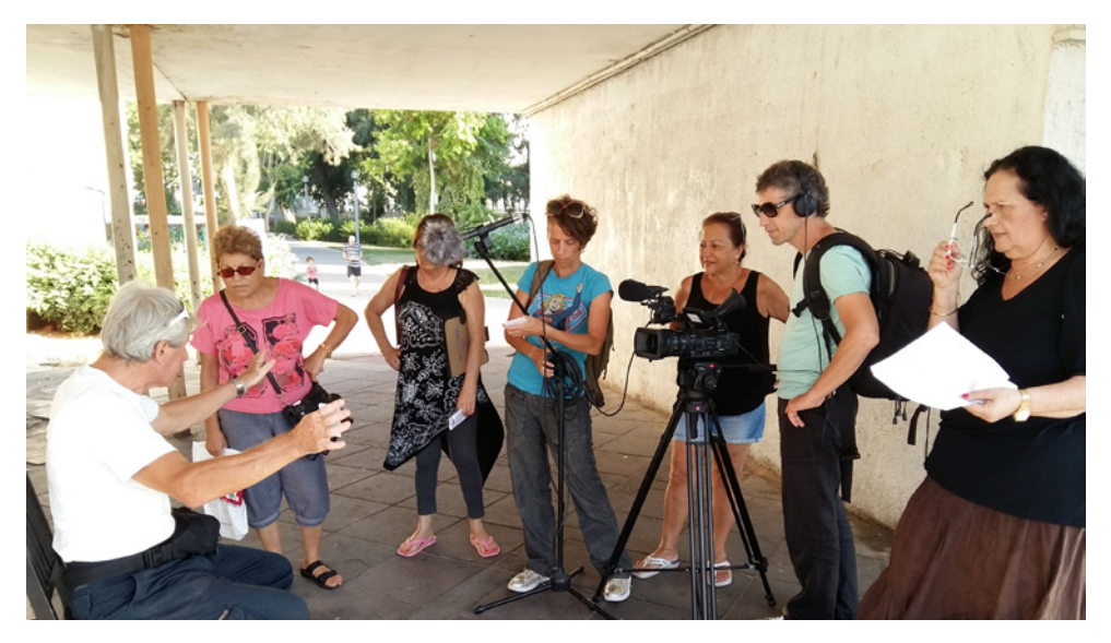
interviewing passers-by at the local commercial centre