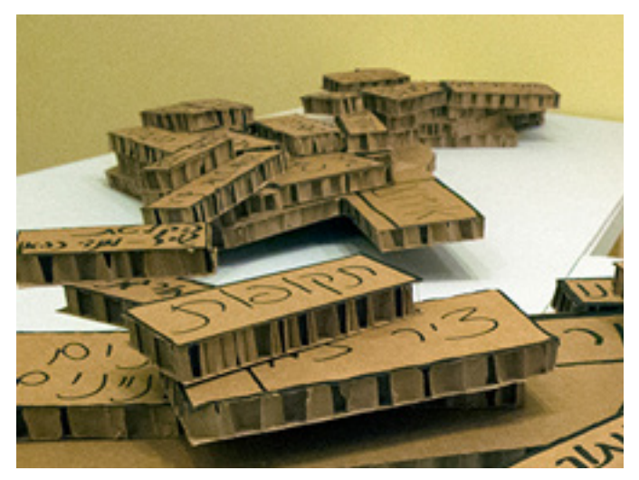
Evolution of ideas