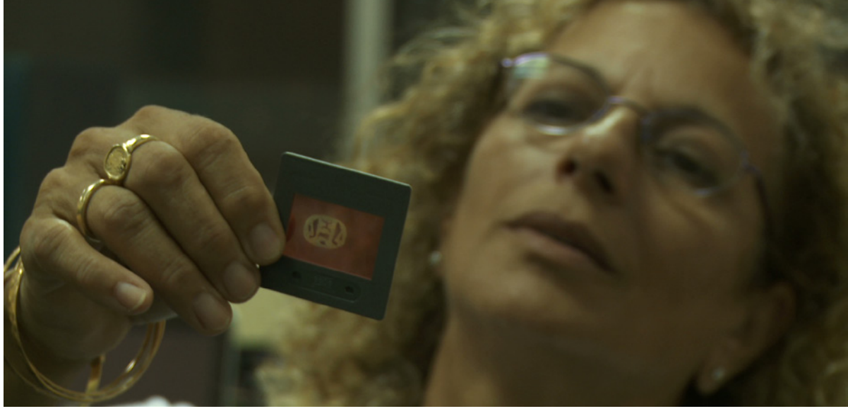
still from video made with museum team about the archeological site