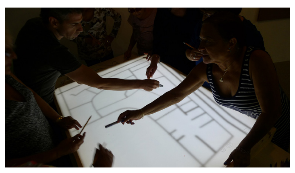
neighbourhood mapping session

Between the weekly meetings the group conducted a research on different aspects of the neighbourhood's history and present that were evoked in the meetings, including visits to different archives, held numerous interviews, field research in the neighbourhood and more. In parallel several workshops and processes were initiated in order to produce exhibits to be displayed in the museum.