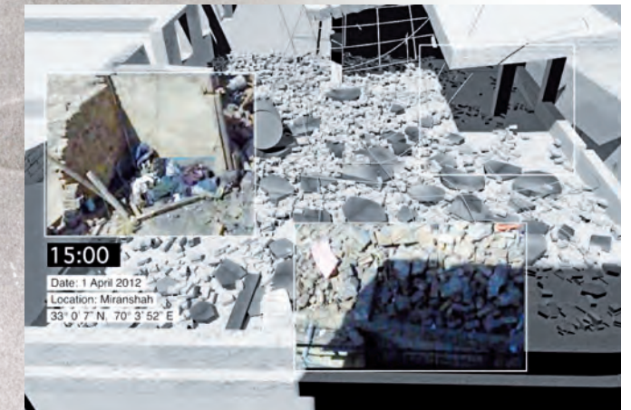
Forensic Architecture , Drone Strikes , 2011-2014, Videos, images, text, and web-based platform, variable dimensions

With this exhibition, we call for an understanding of the view from above as a site where ethics, politics, and aesthetics