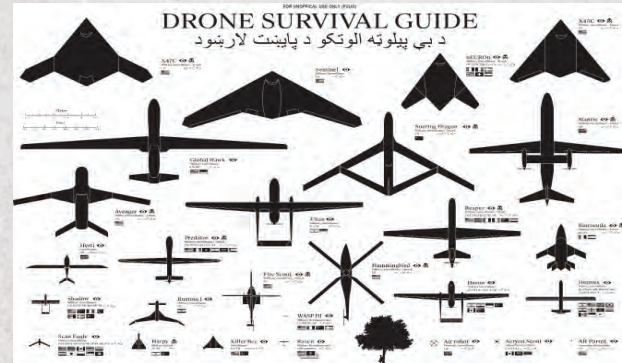
Ruben Pater , Drone Survival Guide , 2013, Offset printed on Chromolux ALU-E mirrored paper, 19 x 13 in

satellite while the other is Google Earth's manipulated image of the same site. By juxtaposing the two images, the artists reflect on notions of truth, resolution, and reliability in relation to satellite imagery and suggest that this "objective" image is often a manipulated image in disguise. Moreover, the play between the different layers allows for speculation into the future of the open sky above the text piece and questions the future vertical development of the neighborhood.