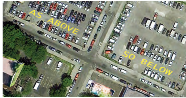
Bik Van der Pol , Elements Of Composition (As Above So Below) , 2011, Site-specific text piece, Images, publication, and sound, variable dimensions

Peter Fend , one of the founders of the Ocean Earth Development Corporation —a research-based, collaborative think tank of artists, architects, and scientists—was the first artist to use satellite imagery as a powerful tool for information production. In the early 1980s, Fend and Ocean Earth purchased civilian satellite imagery from EROS (Earth Resources Observation and Science)—a governmental entity that is also a commercial outlet—in order to monitor and analyze global ecological and geopolitical crisis zones. Intending to provide analysis that was neither politically manipulated nor censored, they sold the story these images contained, such as the ongoing danger of radioactive leakage in Chernobyl, to major media corporations. In addition, they created their own independent cable TV programs and exhibited their research in artistic contexts. Exploring the link between art and information, with special attention to the role of abstraction in understanding raw data, Fend created a series of collages that bring together satellite images, drawings, photos, documents, and text. These collages, all concerned with damaged environments, not only represent Ocean Earth's analysis of a specific geopolitical situation, but also provide a glimpse into the politics behind the process of developing these projects and displaying them.